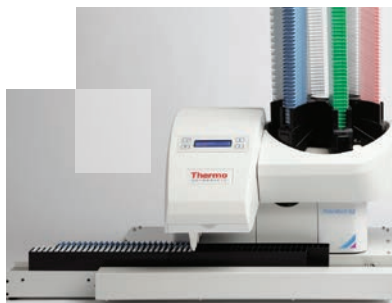
PrintMate AS cassette printer can be used for batch printing cassettes with optional automated collection system as shown.