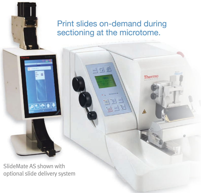
SlideMate AS shown with optional slide delivery system

Print slides on-demand during sectioning at the microtome.