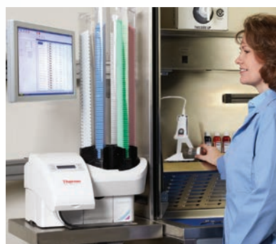
PrintMate AS cassette printer shown with optional all-in-one PC and digital imager.