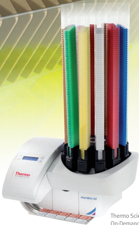
Thermo Scientific™ PrintMate™ AS On-Demand Cassette Printer