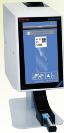
Thermo Scientific™ SlideMate™ AS On-Demand Slide Printer

“Primary labeling errors were reduced by 99.8% with on-demand printing.”