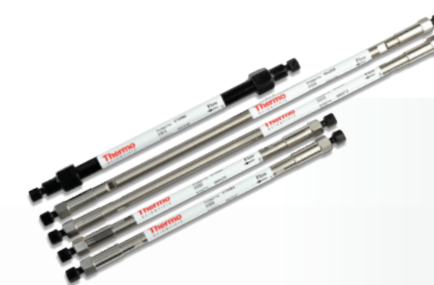
LC and IC Columns and Consumables

Thermo Scientific™ Acclaim™ Accurore™ and Hypersil™ UHPLC and HPLC Columns deliver innovative chemistries tailored for challenging and critically important applications. Application specific columns utilize novel and unique chemistries to provide superior resolution with ease of use for key environmental applications.