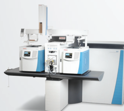
DFS™ Magnetic Sector GC-HRMS

The Thermo Scientific™ DFS™ Magnetic Sector GC-HRMS, the Gold Standard for Dioxins & POPs, is the only GC-MS specifically designed for Dioxin and POPs analysis. The DFS GC-HRMS offers worldwide full compliance with any official Dioxin, PCB or PBDE method (for example EPA 1613, 1668, 1614). Exploit the benefits of highest available Dioxin sensitivity and robustness, delivered by our large-volume ion source. The Thermo Scientific DFS GC-HRMS is the solution of choice for the Dioxin expert lab.