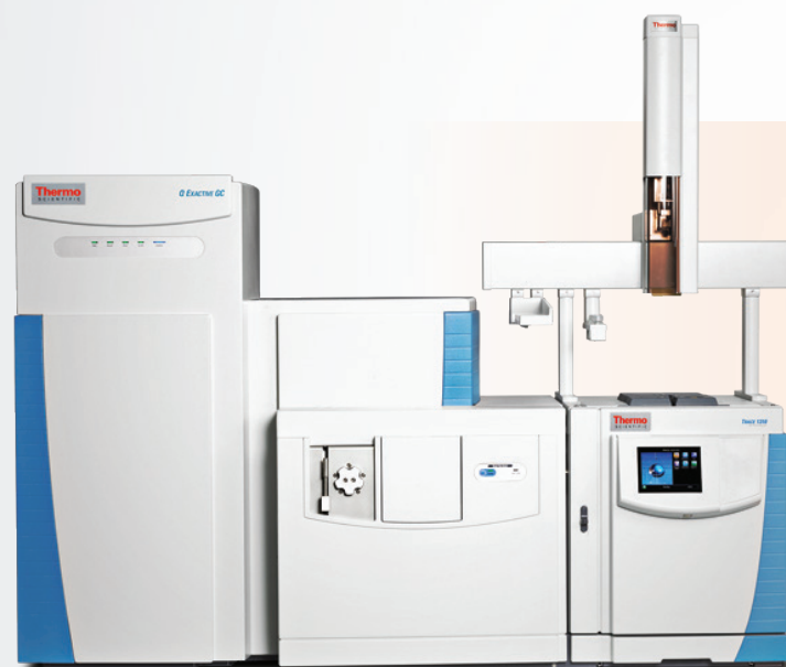
Q Exactive™ GC Orbitrap™ GC-MS/MS system

The remarkable Thermo Scientific™ Q Exactive™ GC Orbitrap™ GC-MS/MS high resolution accurate mass (HRAM) mass spectrometers produce data that can be used for highly sensitive and selective quantitation, as well as for in-depth non-targeted unknown analysis. Built-in databases designed for environmental analyses make quantitation and targeted as well as non-targeted analysis from a single data set absolutely seamless. Additionally, they'll give you the option to reanalyze data retrospectively without the need for sample reinjection.