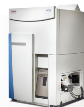
iCAP RQ ICP-MS

The Thermo Scientific™ iCAP™ RQ ICP-MS is the ideal instrument for reliable analytical performance and the ease-of-use needed to meet the demands of the highest throughput laboratories. This complete multi-element analysis solution delivers comprehensive interference removal for assured data accuracy, combined with intuitive workflows to boost productivity. This single quadrupole (SQ) ICP-MS will expand your analytical capabilities. We also offer a portfolio of trace element solutions, including AAS and ICP-OES.