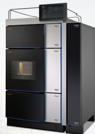
Vanquish™ UHPLC System thermoscientific.com/hplc-uhplc

Successful detection, identification and quantitation of contaminants starts with successful separations. Some materials are more amenable to separation by gas, liquid or ion chromatography, while others require additional techniques to achieve separation. Whatever the method, our environmental experts offer support and guidance to determine which solution best meets your needs today and covers you for the future.