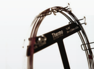
GC Columns and Consumables

thermoscientific.com/en/product/triplus-rsh-autosampler.html