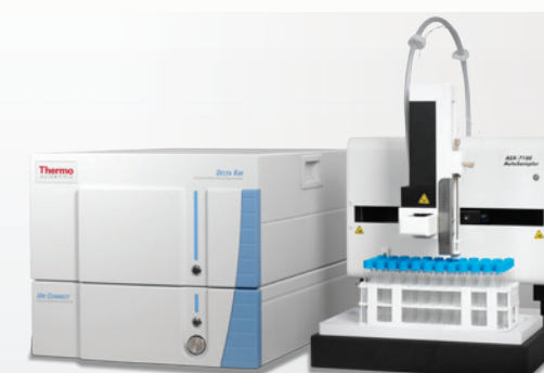
Delta Ray Connect™

The Thermo Scientific™ Delta Ray™ and Delta Ray Connect™ incorporate state-of-the-art mid-infrared spectrometry for the monitoring and detection of CO 2 sources, sinks and fluxes. Both systems also offer calibrated and verifiable data for CO 2 concentration measurements. Delta Ray and Delta Ray Connect are designed for field portability and operational simplicity in mind. Easy to use with a fully automated software solution and workflow, Delta Ray and Delta Ray Connect provide solutions for continuous monitoring of environmental CO 2 as well as discrete sample measurement.