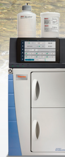
Dionex™ Integrion™ HPIC™ system

The Thermo Scientific™ Dionex™ Integrion™ HPIC™ system ensures versatile and efficient IC analyses through comprehensive application solutions and interactive wellness features that help you adapt to changing demands while keeping your lab running seamlessly.