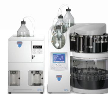
Accelerated Solvent Extraction

Thermo Scientific™ Dionex™ ASE™ 150 and 350 Accelerated Solvent Extraction systems provide walk-away automation that allows you to extract soil and sediment samples overnight. There are no matrix limitations and contaminants can be extracted from low-moisture content or high-water content samples.