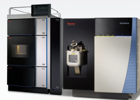
TSQ™ triple quadrupole LC-MS/MS systems

Thermo Scientific™ TSQ Endura™ and TSQ Quantiva™ LC-MS systems provide LODs and LOQs unrivaled in their class. Each offers rugged and reliable operation 24/7, regardless of sample type or matrix complexity. And with an easy-to-use interface that takes the worry out of method development and operation. The result? You can now spend more time thinking about your analysis and less time worrying about instrument set-up and operation.