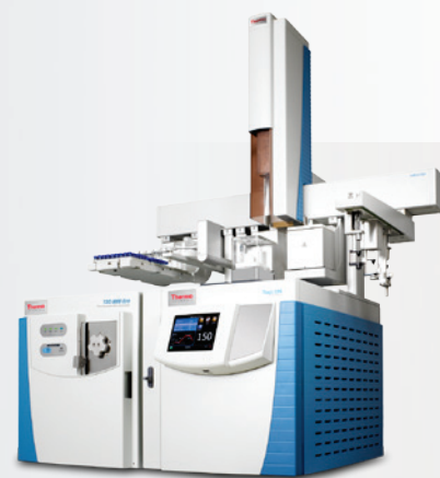
TSQ™ 8000 systems

Setting the standard for sensitive, specific quantitation and identification of targeted compounds, Thermo Scientific triple quadrupole GC, LC and IC-MS/MS systems combine superb sensitivity and selectivity with outstanding productivity and reliability. Equip your lab to efficiently meet ever-evolving challenges as you help safeguard earth's air, soil and water.