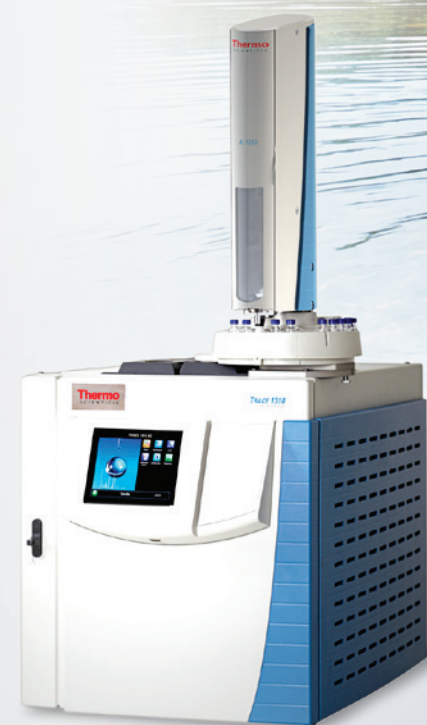
TRACE™ 1310 Gas Chromatography system

Designed with innovative technology and fine detail, the Thermo Scientific™ Vanquish™ UHPLC system delivers a new standard in UHPLC. More results with better separations and easier interaction simultaneously, without compromise. This fully integrated system features high sample capacity for high-throughput workflows, industry-leading pumping performance, amazingly low signal-to-noise and linearity, and much more. All in a system driven by our uniquely versatile Chromeleon CDS software.