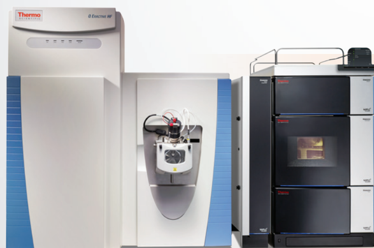
Q Exactive™ Focus hybrid quadrupole-Orbitrap LC-MS/MS system

The sensitivity, selectivity, flexibility and ease-of-use provided by hybrid quadrupole-Orbitrap mass spectrometers have genuinely set the standard for screening and quantitation, identification and confirmation of targeted and untargeted compounds. The Thermo Scientific Q Exactive Focus hybrid quadrupole-Orbitrap MS makes this power accessible to environmental labs challenged by increasing sample numbers and constrained by strict budgets. It simplifies method development, saving time and decreasing costs while reliably delivering unsurpassed results.