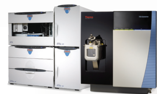
Dionex™ IC-MS/MS system

The Thermo Scientific™ Dionex™ IC-MS/MS system offers unmatched retention and chromatographic resolution provided by high-capacity ion chromatography that complement the detectability, selectivity and identification capabilities provided by TSQ triple quadrupole mass spectrometry for contaminants that include ionic and polar pesticides, perchlorate, and haloacetic acids.