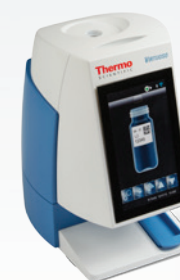
Virtuoso Vial Identification System

Thermo Scientific™ Virtuoso™ Vial Identification System is a fast sample identity and security system that provides reliable and accurate customized sample information printed directly onto a vial while maintaining chain-of-custody deeper into the workflow.