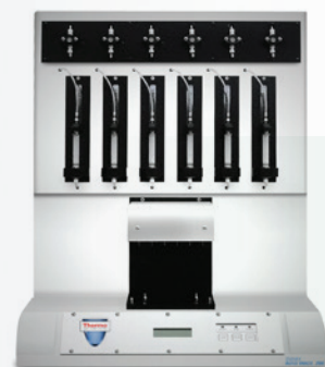
Automated Solid-Phase Extraction

We provide complete solutions for both online and offline solid phase extraction as well as systems for automated solvent extraction, to cover even the most challenging analyses. Coupled with customized solutions, you'll find setting up and running the most demanding separation easier than you think.